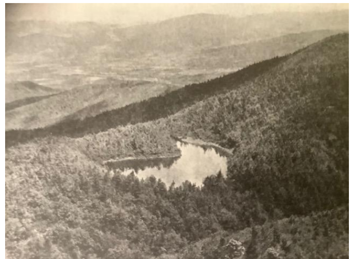
This small lake or "tarn" is the "Lake of the Clouds" on Mt. Mansfield. Crane calls it "the highest water in Vermont."