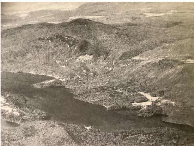
This is Lake Dunmore near Middlebury, Vermont, with the distant Green Mountain Range in a photo taken from the air, circa 1937, by Aerial Explorations, Inc.

Close below the Nose of the mountain, the naturalist would find the fragrant white orchid, and there in the mountain's ear (if it had one) the gray-cheeked, the olive-backed, and the hermit thrush pour their song. More commonly there are the white-throated sparrow and the noisy jay. Few people climb Mansfield to see the flowers or hear the birds, but for the expanse of view; yet the mountain yields many rare items to those who notice the winged things about them and the flowering things underfoot.