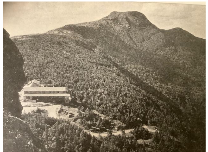
This is a 1937 view of Mt. Mansfield by photographer E. T. Houston with the Mount Mansfield Hotel nestled near.

Another thing I like about Vermont mountains is that they do not show their age. Though far older than the Rockies, the Green Mountains are not bald. Only a few have considerable exposed rock, as on top of Mansfield, Killington, Camel's Hump, and Abraham; with some suggestions of baldness on Mt. Hunger, Ascutney, and others. For the most part, the Green Mountains are green—lushy green in summer; of kaleidoscope color in the fall; and a happy combination of snow-white and spruce-green in winter. And then it's spring again and new greens!