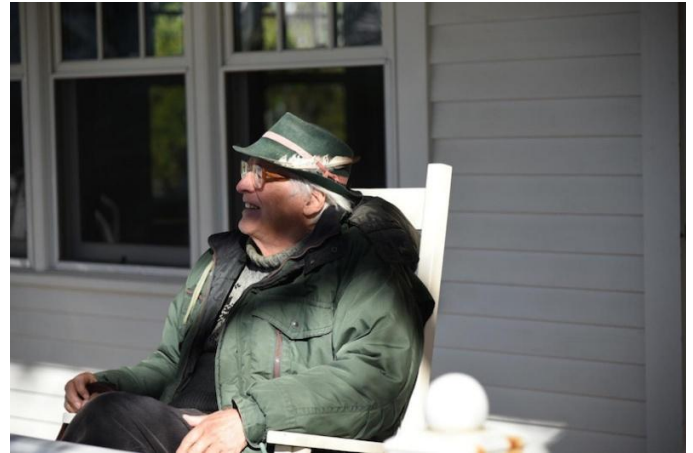
Edward Hoagland outside St. Andrew's church in Edgartown, Massachusetts, circa 2012.

of his delight at being able to speak freely to me... felt alarming. As a married woman, I couldn't imagine introducing him to my husband.