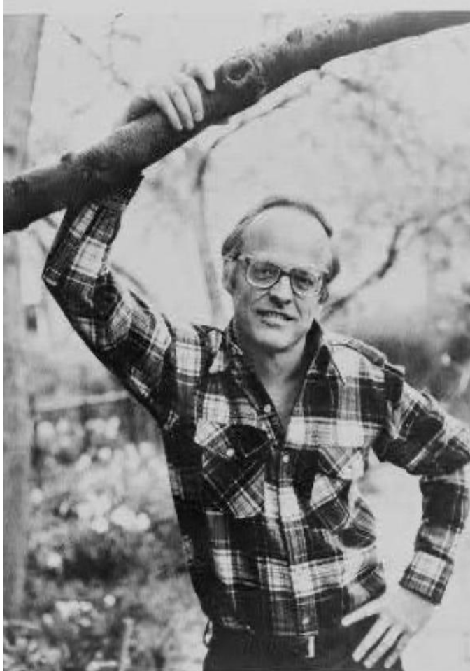
Edward Hoagland, date and photographer unknown.

Any writer deeply familiar with Edward Hoagland's nature and travel writing was in awe of him. Hoagland was heroically prolific, publishing his first book while still at Harvard—a novel that won him the 1954 Houghton Mifflin Literary Fellowship. He produced five faintly praised works of fiction in his lifetime, but early in his career, he sensed he should renounce fiction-writing to concentrate instead on recording what he observed. He cultivated keen powers of awareness that soon dwarfed “mere” imagination. He was the author of more than twenty books by 2005. As he continued to write and publish essay collections well into his eighties, Hoagland elevated the art of the essay to new heights.