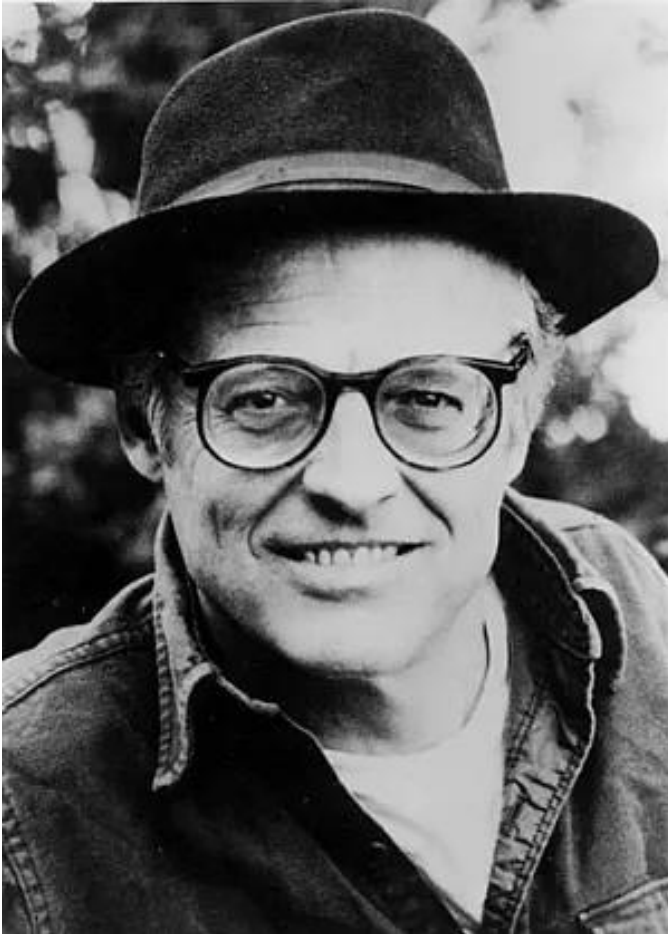
Edward (Ted) Hoagland in an undated photo.

Furthermore, Hoagland was a master at gaining a reader's trust. His personality became more and more vivid as he commented and analyzed and described. Who he was and what he felt seemed so remarkably, eagerly revealed in his cascading words, that he became an instant intimate. This quality is surely what accounts for much of the unique power of his essays.